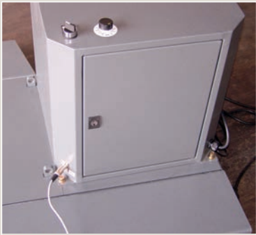
All Enclosed Motor and PLC