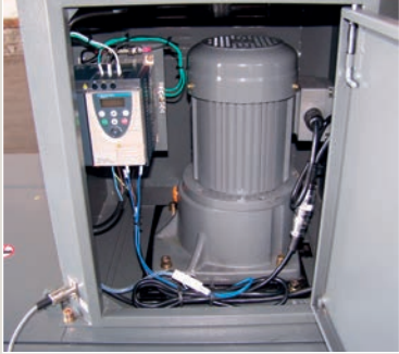
Heavy Duty 1 hp Motor